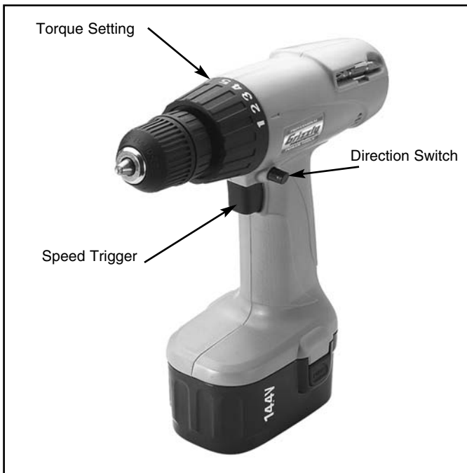
Fig 3. Location of controls.